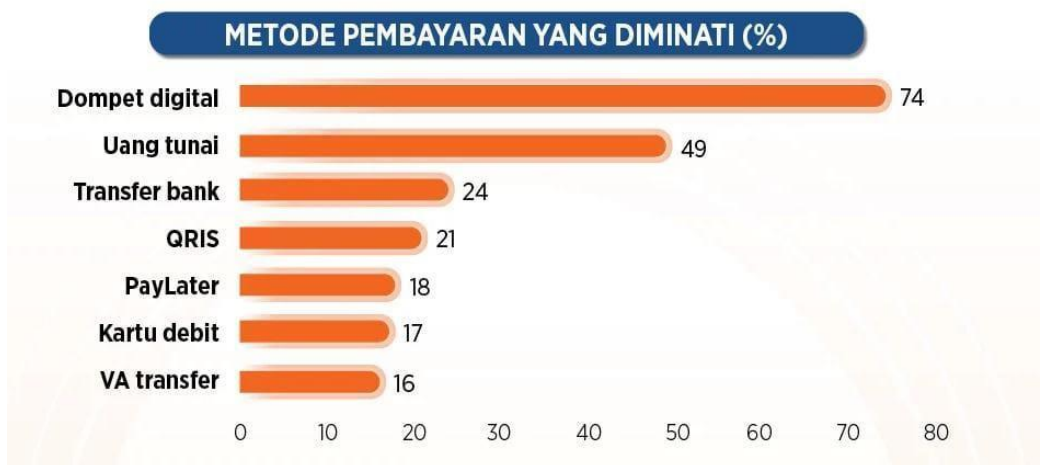
Figure 1. Insight Asia Survey Results “Consistency Leads: E-Wallet Industry Outlook 2023”

In this digital era (2024), technology has been embedded in people's daily lives and affects various sectors, including the payment system. One of the innovations that has changed the way people make transactions is a digital wallet, also known as an e-wallet. E-wallet is an application used by users to carry out transaction activities without the need to use cash but using electronic devices such as smartphones (Sriyono et al., 2023). In addition, e-wallets offer speed and convenience in making transactions, which makes them increasingly popular among the public, especially the tech-savvy younger generation.